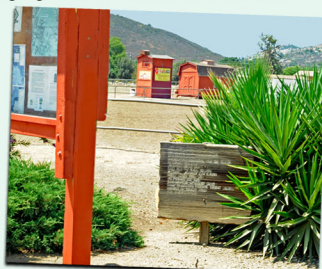
Located behind the kiosk is this section of the original San Marcos Arena Sponsor sign. Does anyone know what happened to the remaining original sign sections? (See original signs in historical arena photo lower right).

Historic photos and information courtesy of the San Marcos Historical Society. Visit Heritage Park!