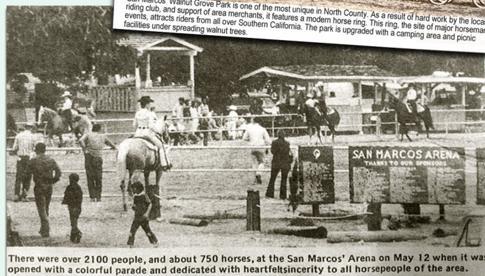
There were over 2100 people, and about 750 horses, at the San Marcos' Arena on May 12 when it was opened with a colorful parade and dedicated with heartfelt sincerity to all horsepeople of the area.

The Walnut Grove horse park is always open to the public and continues to be used for horseshows, gymkhanas, clinics, Escondido Mounted Posse practice drills, and as a large animal evacuation center when fires threaten nearby communities. San Marcos Fire Communications Team and Community Emergency Response Team (CERT) use the park for an emergency communication outpost. The park is a gathering place for all types of activities including weddings, square dances and a family campout. Our summers have been kicked off over the past few years by the Rock, Blues & BBQ Festival. Regular soccer games and practices keep the park busy on weekends. In the last two years, several soccer tournaments fill the park beyond capacity.